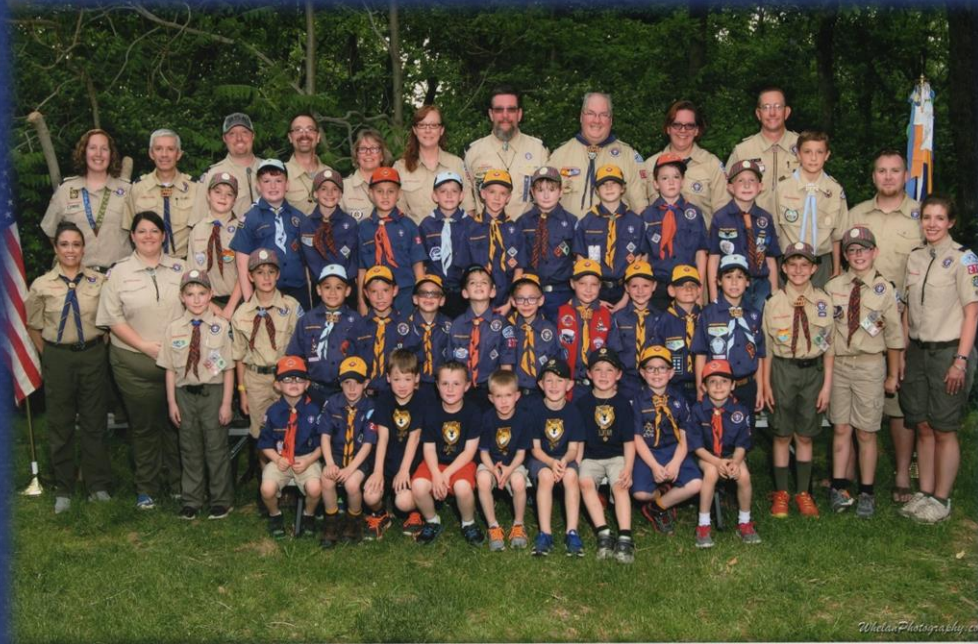
2017 Cub Scout Pack 278

Questions? Contact: Lauren Dutrow "Parent Coordinator" at laurendutrow17@gmail.com or text (301)748-7203