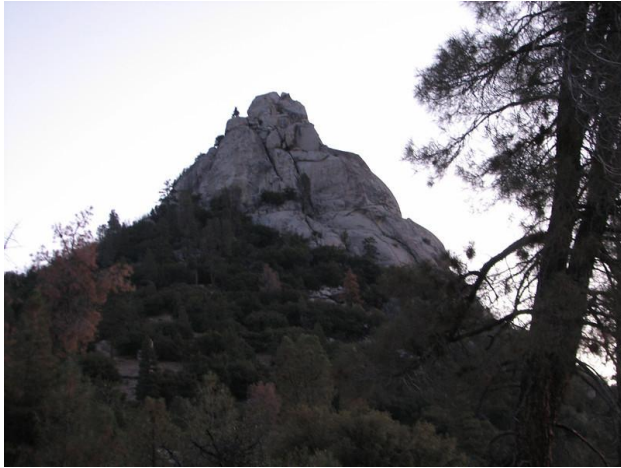
zzzzzzz 5:38 AM as we approach Sentinel Peak.