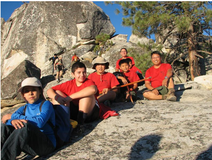
The group just at the top of the hike, just below the peak.