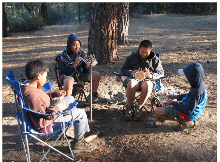
The guys working on Basketry frequently gathered by the water spigot to work on their projects. It was our version of the "water cooler".