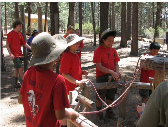
The "Pioneering Boys" work on their knots.