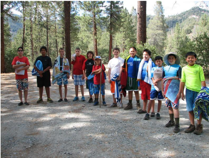
All ready for their swim test!