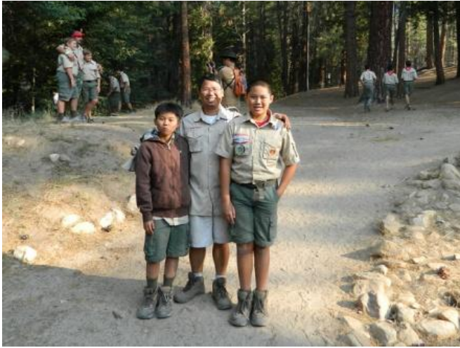
The Trans, ready to go, on the last day.