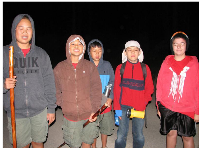
4:40 AM on Tuesday, ready for the hike to Sentinel Peak. Apparently only one Scout here is not asleep!